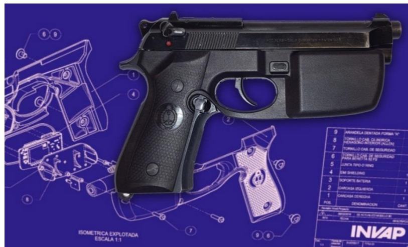
TAG for Beretta 92FS